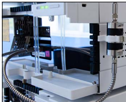
Fig. 2 Flow cell mounted on AZURA detector